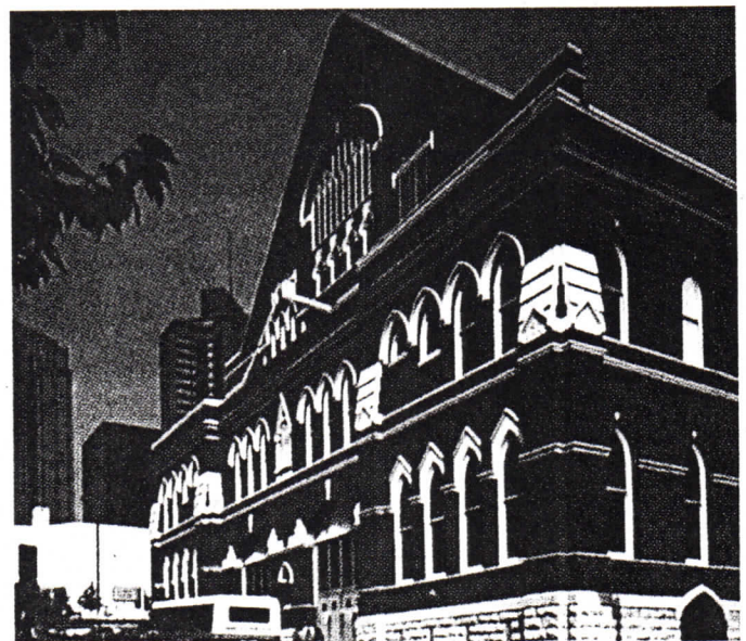
The historic Ryman Auditorium in downtown Nashville was once home to the Grand Ole Opry.