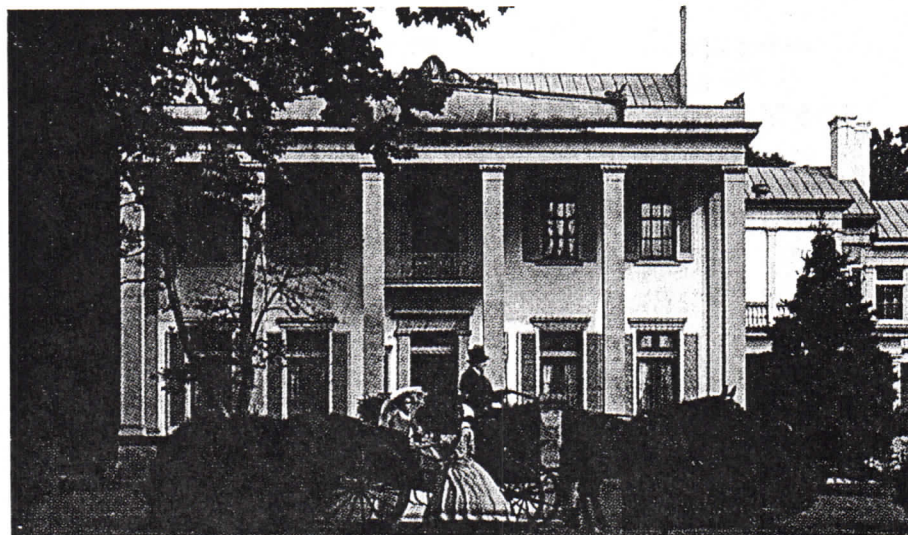
Belle Meade Plantation

Location: Washington Room, Opryland Hotel Fee: The dinner/dance is included as a part of the physician and spouse/guest registration. You will receive a voucher(s) in your registration packet to be exchanged for a ticket. Additional tickets can be purchased for non-registered family members or guests at $75.00 per person. Please note: The Saturday evening dinner/dance attire is "Texas Black Tie" which translates as tuxedo jackets, blue jeans and boots for the men and denim skirt/evening attire for the women. Or if you prefer—a costume reflective of your native country.