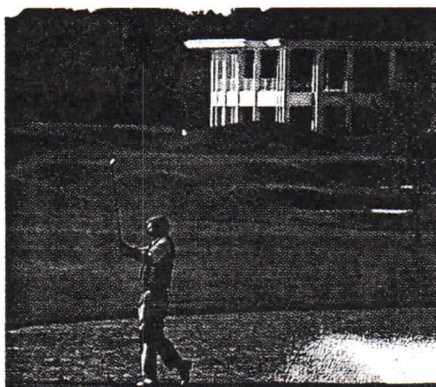
Enter the ISHRS Golf Tournament.