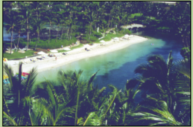
Hilton Waikoloa Village