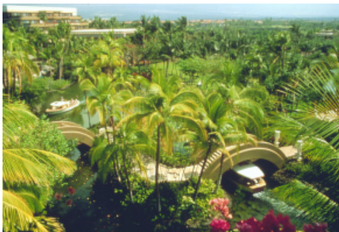
Hilton Waikoloa Village