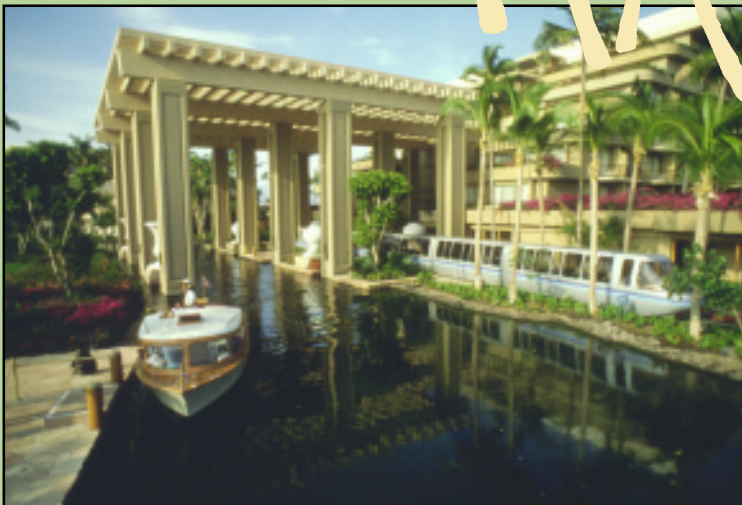
Hilton Waikoloa Village