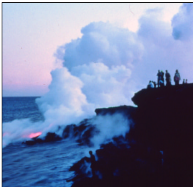
Watching lava flow in ocean.

This workshop will provide an introduction to the often misunderstood field of tissue engineering (cell therapy) for hair loss. Emphasis will be placed on understanding basic concepts such as cloning, tissue engineering, cell therapy, and cell culture. The workshop will be directed at the practicing surgeon and no prior research background is necessary.